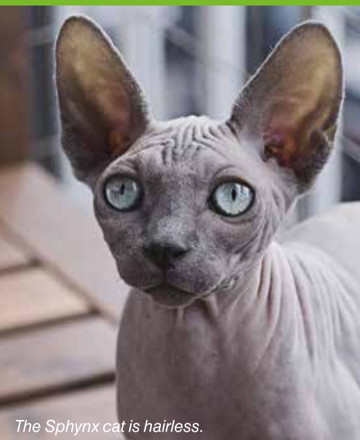
The Sphynx cat is hairless.

However, aside from hypoallergenic pets, you can also prevent or reduce the severity of allergic reactions by keeping pets out of bedrooms and spaces you regularly frequent, washing their bedding often, and washing your hands after petting them.