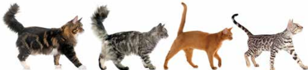
The Maine Coon cat (far left) is bigger than your average house cat.

Be ready to do your research if you believe an exotic cat such as a Maine Coon may be for you. Their needs can often be greater than the average moggy, and it is worth having a discussion with your vet to make sure you're as knowledgeable as possible for the new arrival.